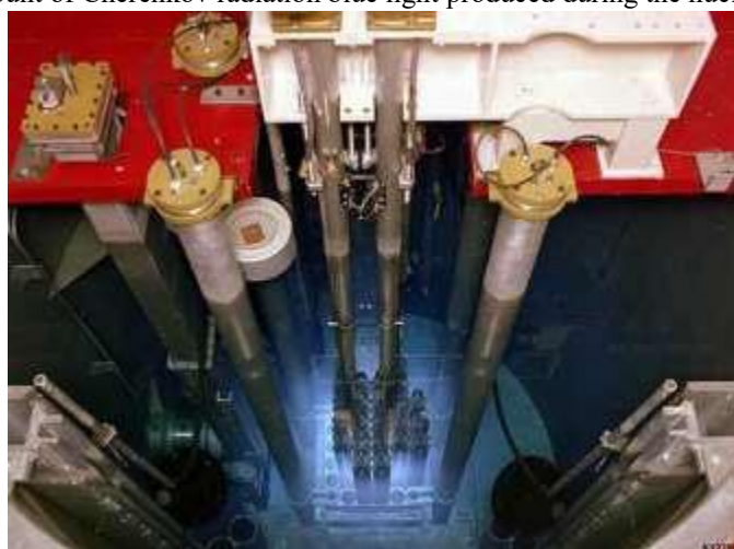
Figure 3. Blue light due to Cherenkov radiation in a nuclear reactor.

If it is an electromagnetic wave, when the speed of the object moves faster than the speed of light, the shock wave effect of the electromagnetic wave occurs, such as Cherenkov radiation. Since the speed of light in the water is much lower than the speed of light in the vacuum, when the velocity of the particles exceeds the speed of light in the water, a shock wave effect occurs in the water. This effect is called Cherenkov radiation. Figure 2 is the aura of the Cherenkov radiation generated by the high-speed movement of neutrino in the water detected by a super-Kamioka detector. Figure 3 is a graph of the large amount of Cherenkov radiation blue light produced during the nuclear reaction.