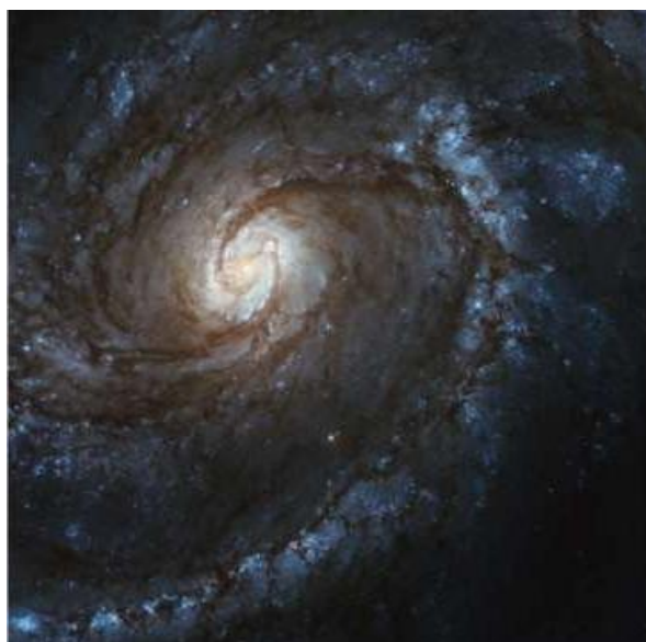
Figure 5. High-brightness light from the center of the spiral galaxy M100.

Light is usually very strong in the center of many galaxies. Figure 5 shows the high-intensity light from the center of the spiral galaxy M100.