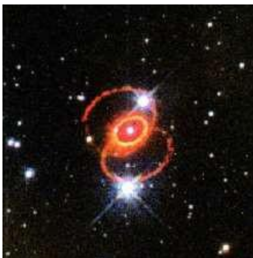
Figure 4. Aura formed after the outbreak of supernova 1987A.

As for the light emitted by the aura, it is formed by the concentrated release of energy at certain spatial points.