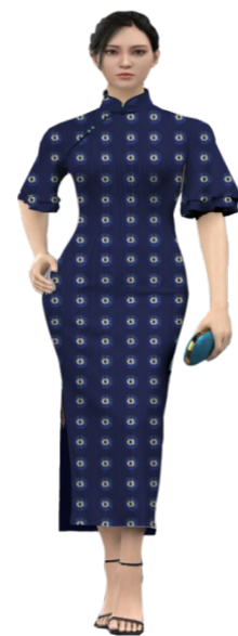
Fig. 2 Blue clamp-resist dyeing cheongsam virtual 3D display

2021 General Scientific Research Project of Education Department of Zhejiang Province (Project No. Y202148089)