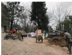
Figure 3 villagers work in a home-stay inn that will open soon