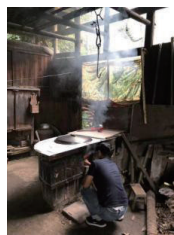
Fig. 2 Kitchen in Villagers’ home