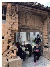
Fig. 1 villagers of Shuiquan Village

Shuiquan village is located on Zhaogong mountain, the main peak of Qingcheng Mountain in Dujiangyan, Chengdu. This small village has a beautiful scenery of “winding paths leading to seclusion”. However, due to inconvenient transportation and lack of arable land, this small village is extremely poor. Most of the young people go out to work, and the permanent population in the village is mainly the left behind elderly, left behind children and left behind women, which is a typical “613899 army” [14] . The villagers have no formal work, and the most common is to gather in groups to play cards and chat (Figure 1). In many places, modern basic living facilities such as water, electricity, optical fiber and gas can not be guaranteed, and they are still in the stage of kerosene lamp lighting and local stove making fire, so life is extremely difficult (Figure 2).